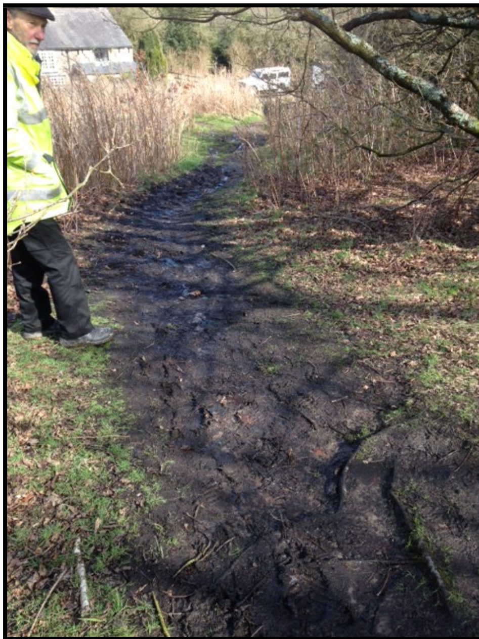
Footpath at Higham Cottages, April 2016.